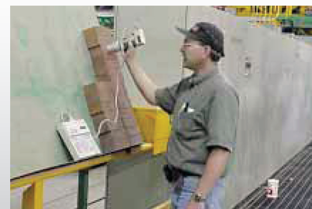
Figure 2: Reading the Color of a Production Run

Other areas of use for the colorimeter have been in the color evaluation of both incoming body raw materials and granular