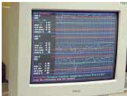
Figure 4: Daily Report on Color