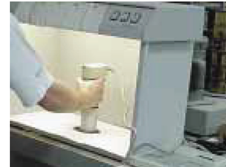
Figure 6: Color Check of a Red Iron Oxide

The NBRC has used color measurement in both research projects and field complaints. In the study of capture (body) additives to possibly reduce emissions, the maximum addition rates of the additives were established based on color. Decisions could then