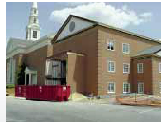
Figure 8: The Completed Addition with Successful Color Match

be made as to whether the additive might be effective without changing the color. Body additions of fluxes, bottom ash, fly ash, etc., can be evaluated in the same way. Also, the addition of recycled process water or effluent water can be tested for effect on color. Color monitoring in these cases can establish standards which can help solve environmental problems without sacrificing product quality and integrity.