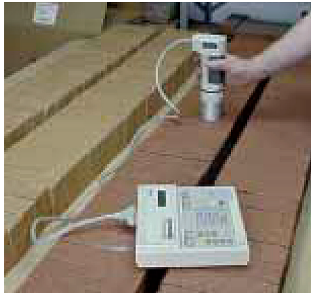
Figure 3: Color Room Layout