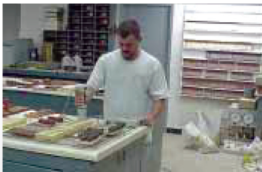
Figure 5: Quality Control of Raw Material Figure 3: Color Room Layout (Note: Master Display Rack in Background)

slabs were face set and placed at various locations on a kiln car at Plant 3. They were fired and the colors evaluated for depth and hue, along with overall range. Several trials were made using similar procedures until a color match was made. The