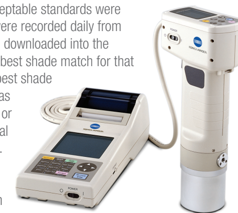
Figure 2: Reading the Color of a Production Run Figure 5: Quality Control of Raw Material Figure 3: Color Room Layout (Note: Master Display Rack in Background) Figure 4: Daily Report on Color Figure 6: Color Check of a Red Iron Oxide from specially selected samples to best represent the range of a given day's production. To select these samples, multiple kiln cars were used as well as multiple locations from each kiln car. About 50 daily samples are collected and taken to a color room for analysis (Figure 3 ). In addition to the color layout, 100 brick are selected daily for

The next step in consistent color control was to develop targets for the various product shades. Using current production runs, old master panels, and existing runs from the inventory yard, targets were established using Minolta Spectra QC software for the 13 product colors, with 3 to 4 shades per product. This process proved to be very tedious and took over 6 months to complete. Once acceptable standards were developed, values were recorded daily from production runs and downloaded into the software to find the best shade match for that run (Figure 2). The best shade match was defined as the target that 50% or more of the individual brick values fell into. The color values for the current production runs were taken