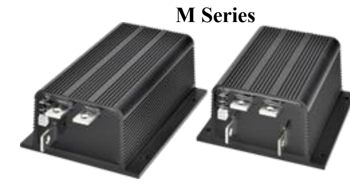
PM Motor Controllers